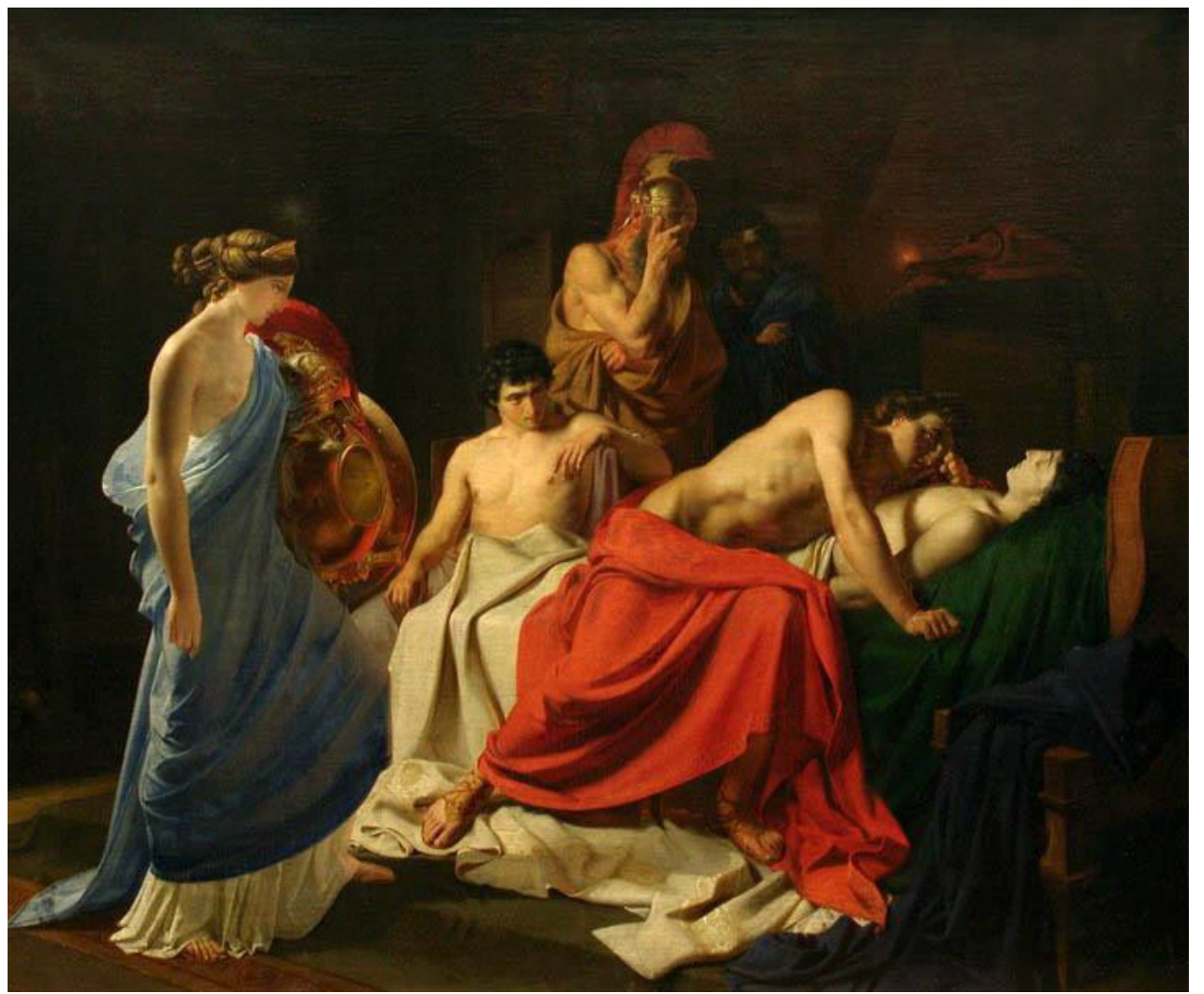
Plate 2: Nikolai Ge, Achilles Lamenting the Death of Patroclus, 1855.

Phaedrus began by affirming that Eros is a mighty god, and wonderful among gods and men, but especially wonderful in his birth.