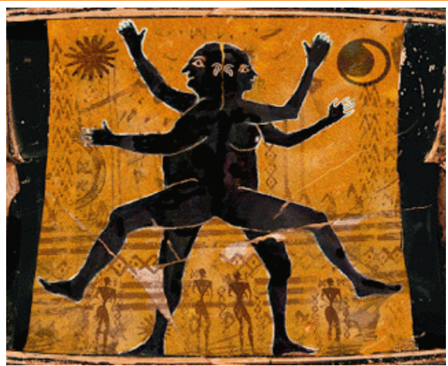
Figure 1: The androgyne<sup>51</sup>

"Yes," said Aristophanes, "the hiccup is gone; not, however, until I applied the sneezing; and I wonder whether the harmony of the body has a love of such noises and ticklings, for I no sooner applied the sneezing than I was cured."