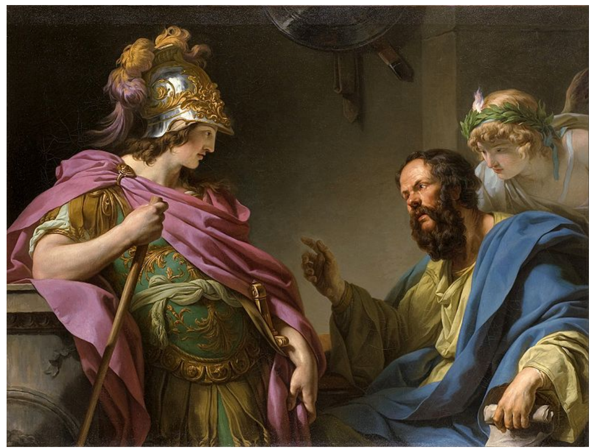
Figure 5 Alcibiades being taught by Socrates, François-André Vincent, 1776.