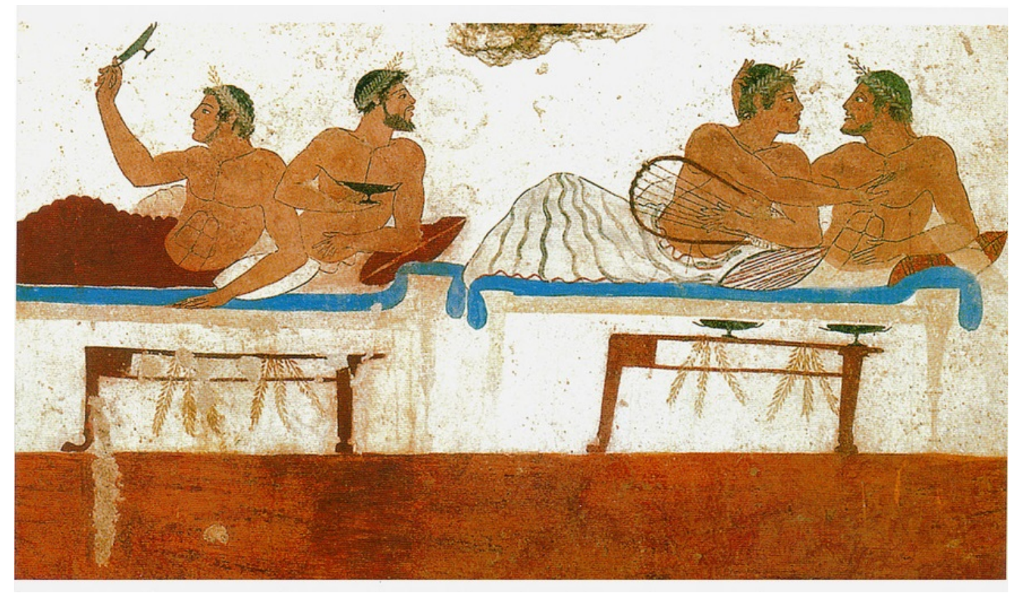
Figure 16 Pederastic couples at a symposium, as depicted on a tomb fresco from the Greek colony of Paestum in Italy,