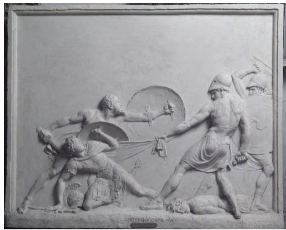
Figure 12 Antonio Canova, Socrates saves Alcibiades in the Battle of Potidea (1797), Accademia Nazionale di San Luca (Rome)