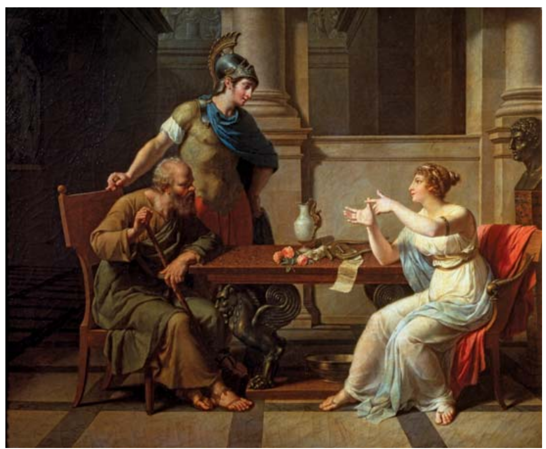
Figure 11 Alcibiades (standing) with Socrates (seated left) and Aspasia, depicted in the painting Socrates and Alcibiades at Aspasia by Nicolas-André Monsiau, 1801; in the Pushkin Fine Arts Museum, Moscow.