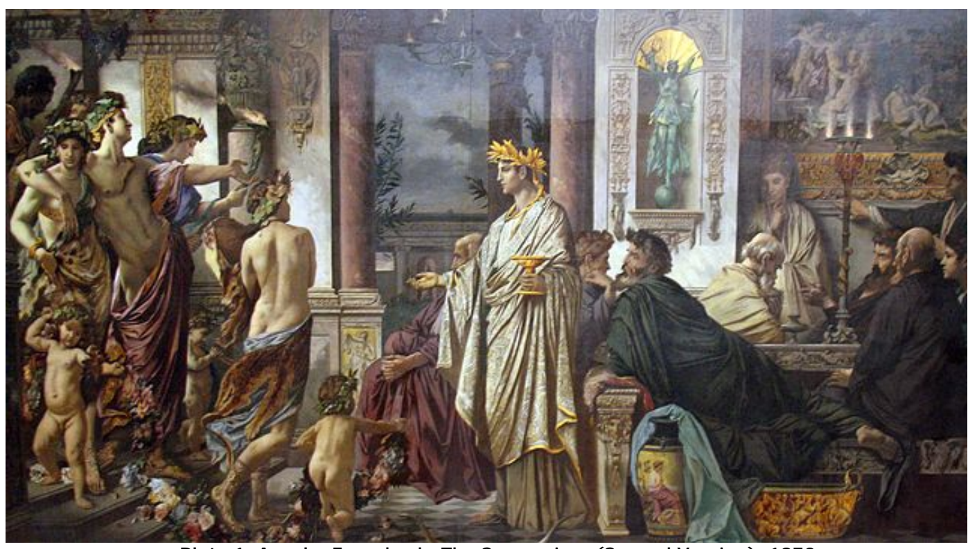
Plate 1: Anselm Feuerbach, The Symposium (Second Version), 1873.

Edited, annotated, and compiled by Rhonda L. Kelley