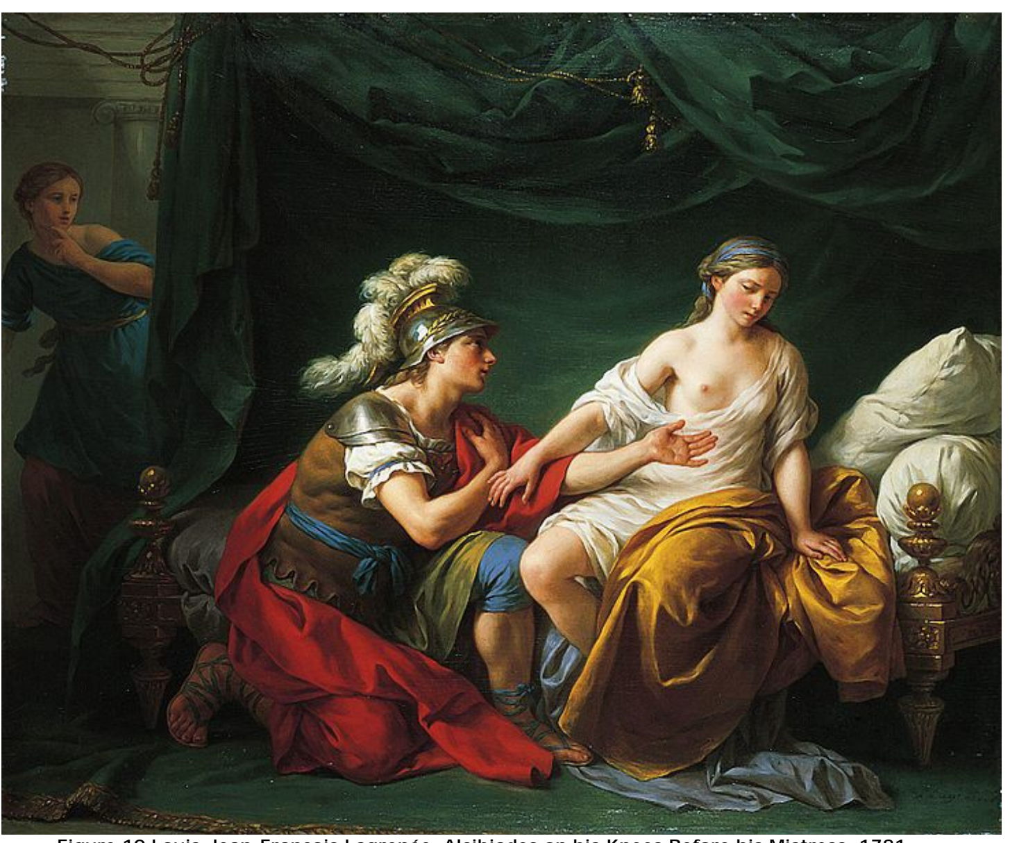
Figure 10 Louis-Jean-François Lagrenée, Alcibiades on his Knees Before his Mistress, 1781