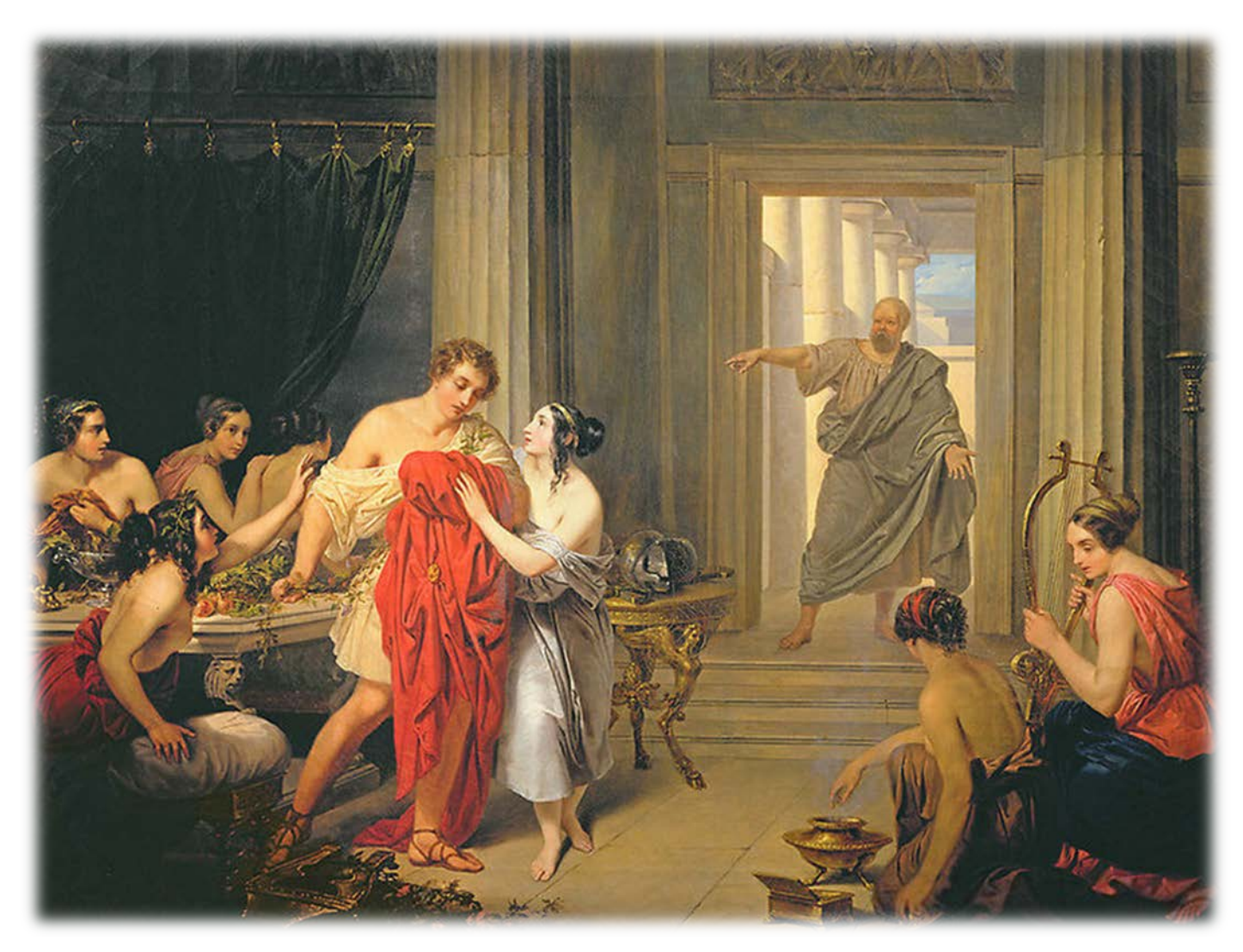
Figure 7 Figure 11 Cosroe Dusi, Alcibiades amongst the hetaerae, 19th c.