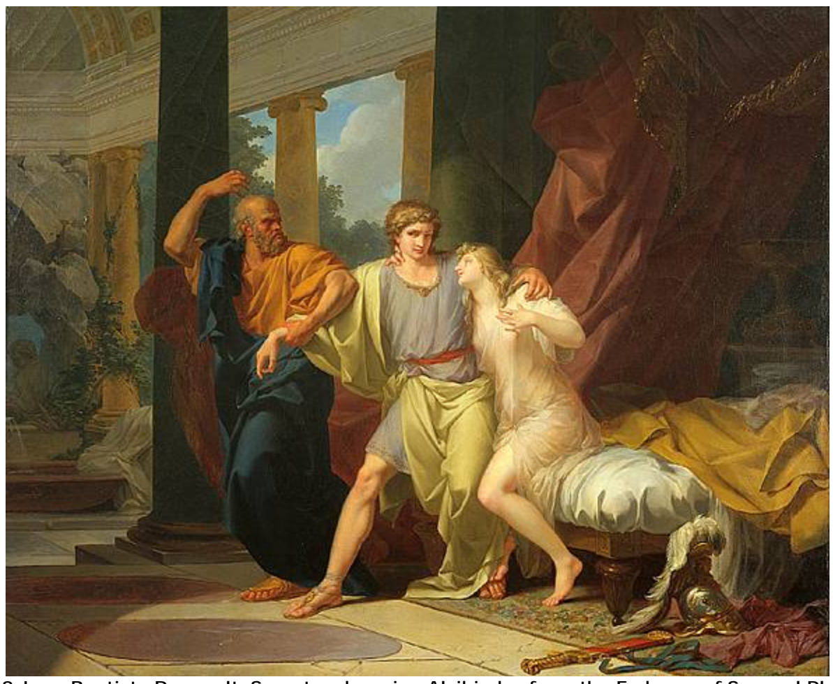
Figure 8 Jean-Baptiste Regnault, Socrates dragging Alcibiades from the Embrace of Sensual Pleasure, 1791.