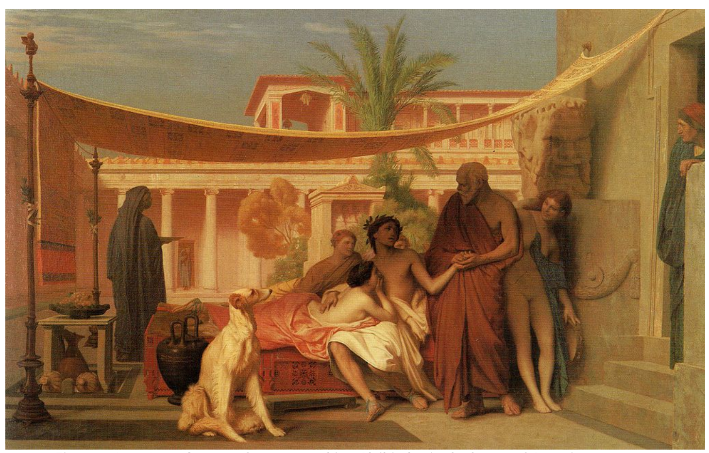
Figure 9 Jean-Léon Gérôme, Socrates seeking Alcibiades in the house of Aspasia, 1861.