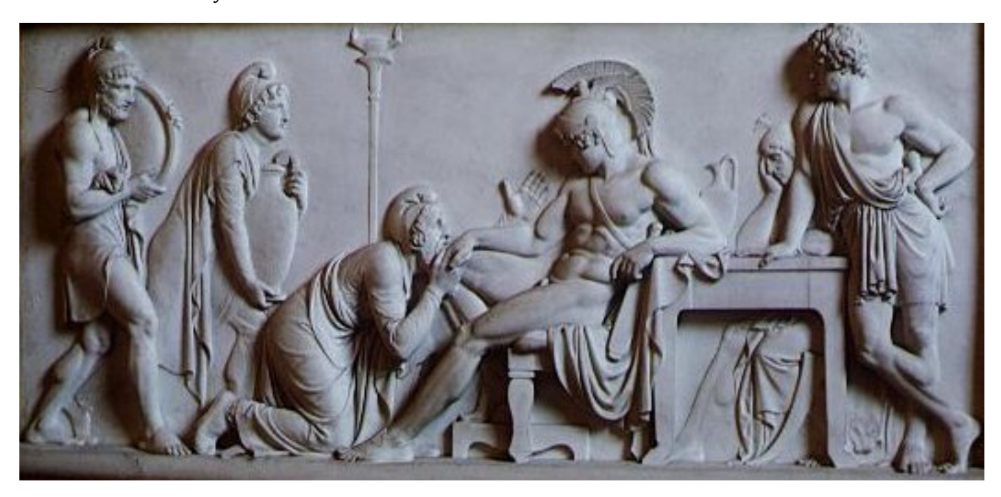
FIGURE 7 PRIAM PLEADS WITH ACHILLES FOR HECTOR'S BODY, BERTEL THORVALDSEN, MARBLE RELIEF, 19^{\text{TH}} C., THORVALDSENS MUSEUM, COPENHAGEN

Priam ransoms the body of Hector—Hector's funeral.